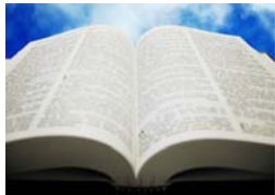
A better understanding of God's Word

The Master's Program will be in full swing starting Registration August 14, 2009. Classes will meet on Thursday once a month where instruction, guidance and materials will be handed out